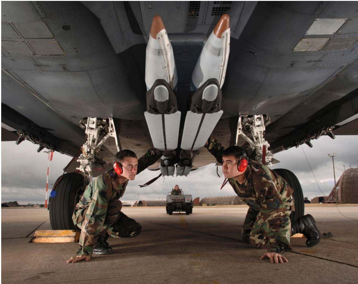
Casing of the GBU-39/B - Wings of the GBU-39/B in folded-back position

The GBU-39 is also designated as SDB1, and is the first of the Small Diameter Bombs: it is conceived as a cheap bomb which gives reduced collateral damage but is excellent at penetrating steel and reinforced concrete. Despite its small size, it is a “bunker-buster” bomb and it was sold to Israel as such.